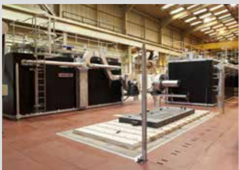
Selection of recent furnace projects

66kW Gem Stone cleaning skid comprising of preheat furnace stations and salt cleaning stations. The corrosive cleaning salt has resulted in robust design of the salt pot. This will be incorporated into a comprehensive laboratory spec cleaning procedure resulting in commercially usable gem stones. The system will be fully automated and designed to involve little or no human interaction in order to protect against the corrosive nature of the salt.