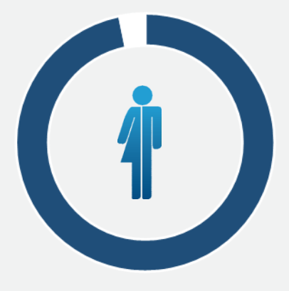
3.6% 96.4% MALE