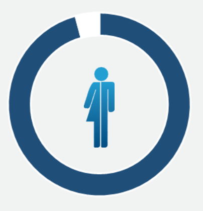
2.3% 97.7% MALE