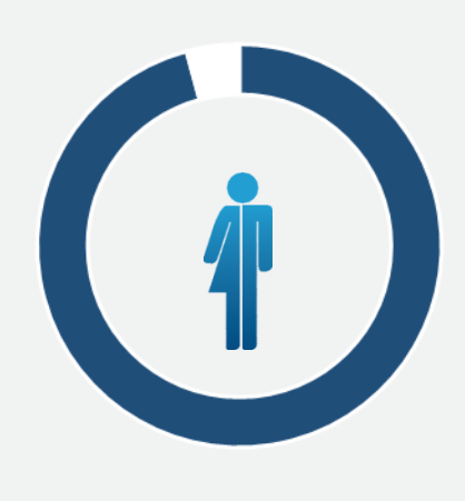
3.1% 96.9% MALE