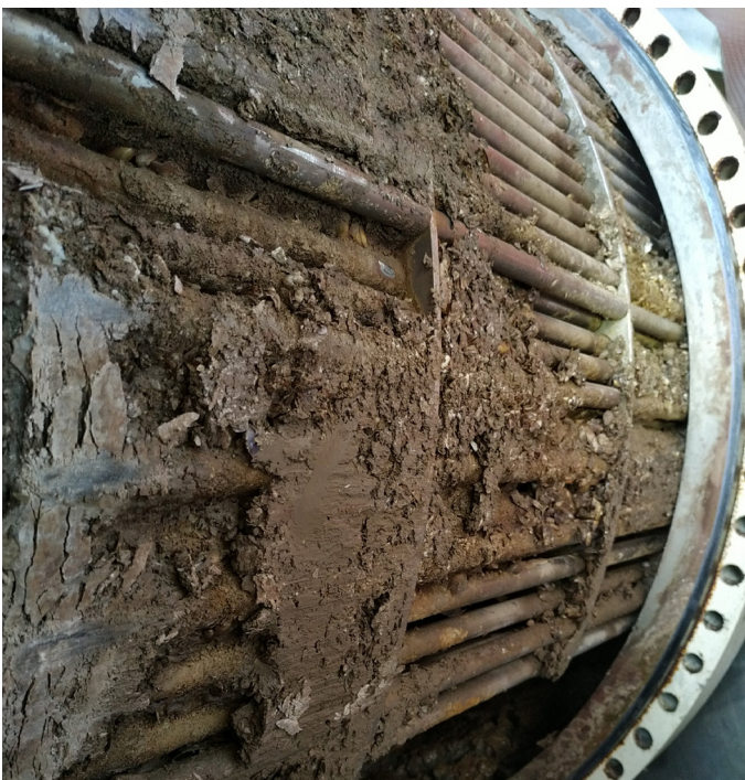
Photo: Before cleaning

Tube bundles are located inside shell and tube heat exchangers. The tube bundles are positioned within a cylindrical shell, where fluids at different starting temperatures (either liquids or gases) pass through and over tubes.