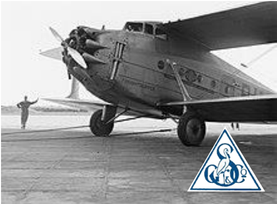
Stork 1.0 + 2.0

... has also been re-invented and had changed.