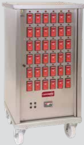
36 Channel Unit

As new techniques develop, new challenges are faced. Therefore, new procedure, techniques and product development is a priority for Cooperheat in order to meet the future requirements of industry. Globally recognised as innovators in thermal technology, Cooperheat are experts within this highly specialised field and can offer the widest spectrum of consultancy services.