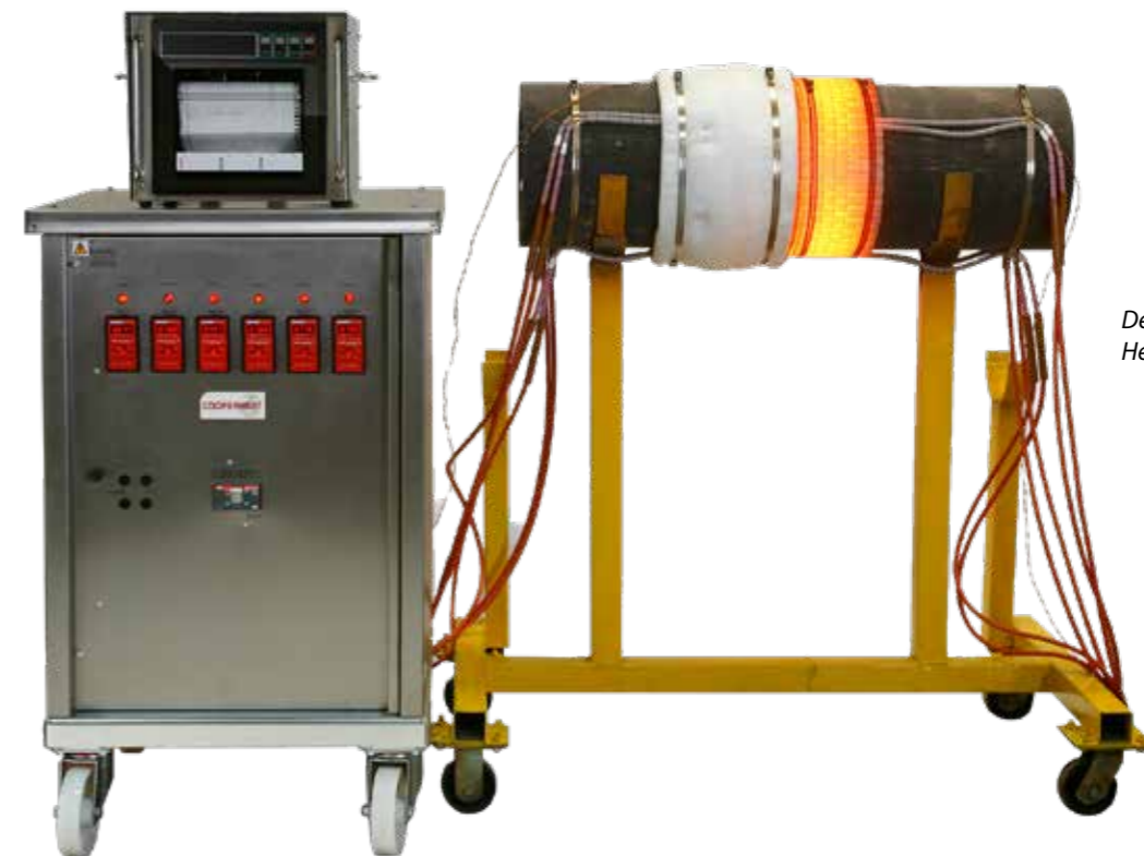
Demonstration of Heat Treatment set up

There are a variety of application methods for heat to weld geometries in order to achieve the desired temperature, ranging from locally applied electrical heaters, to larger gas fired furnaces. The method used is usually determined by the fabrication geometry, size, access restrictions and site constraints.